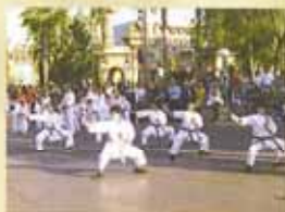
Athlete Celebration Experience